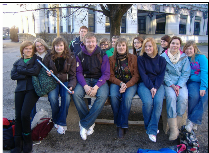
Enjoying a quiet moment at the Lycée Charles Poncet