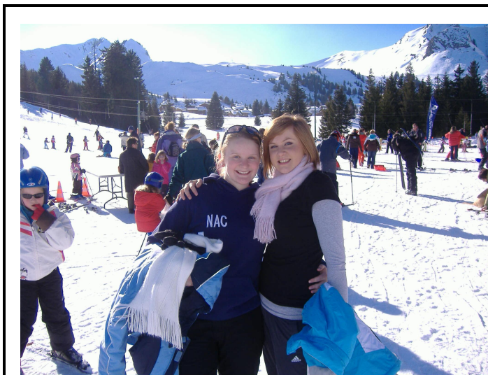
Getting ready for an afternoon's sledging

The trip was a very enjoyable and educational experience and we are all now looking forward to the return visit of our French partners in April.